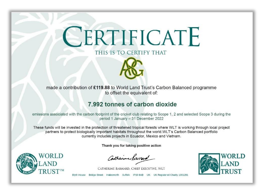
Eight Ash Green has offset with World Land Trust for over a decade

EAGCC will offset all our projected emissions this year. We calculate that 61 tonnes of offset are needed to fulfil our vision of Carbon Net Zero by 2030. This assumes that 22% reductions are made annually. Emissions will increase as scope is widened and this figure will change.