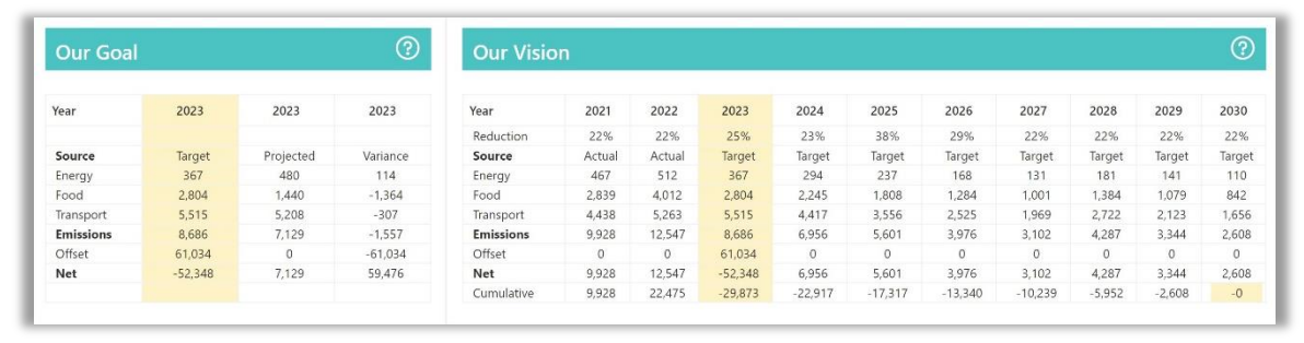
EAGCC Goals and Vision to Carbon Net Zero by 2030

This brief report summarises Eight Ash Green Cricket Club's progress towards Carbon Net Zero in 2030.