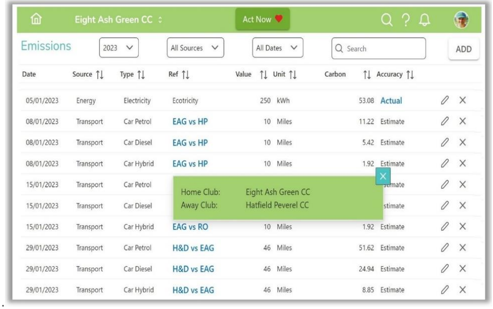
Transport emissions are calculated automatically from fixture data and DfT factor tables

Projected emissions from all sources total 7.13 tonnes and is within our 2023 target. Updates are done centrally and we are recruiting Carbon Champions to do this 'live' via mobiles in future.